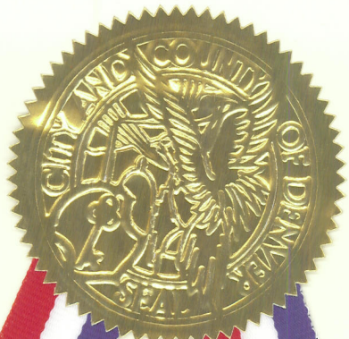
MICHAEL B. HANCOCK MAYOR

A handwritten signature in black ink, appearing to read "Michael B. Hancock".