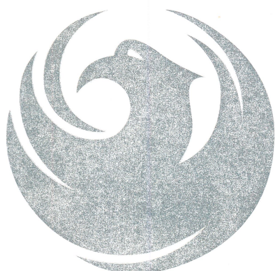
Mayor Kate Gallego City of Phoenix

in the City of Phoenix and urge all Phoenicians to join us in recognizing this important day.